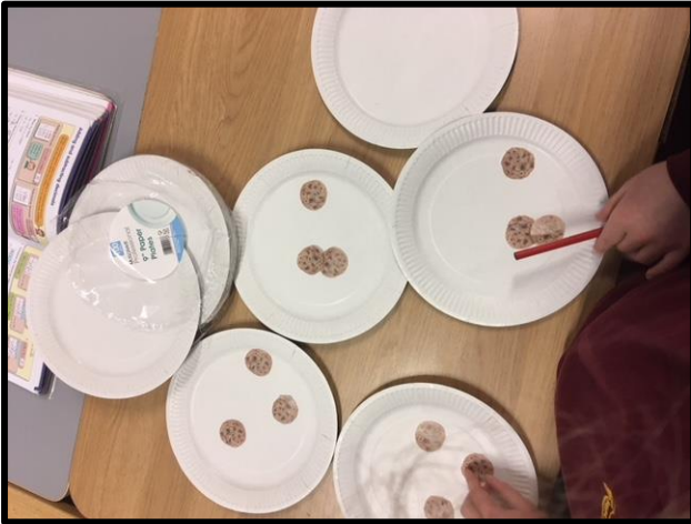
Figure 1: Dividing the cookies